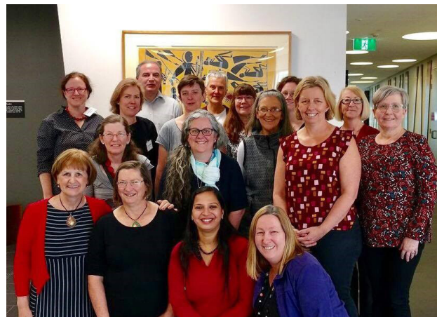
Pictured: Some of the WBTi team

The WBTi tool is made up of 15 indicators in total. Each indicator has a score of 10, meaning the country ends up with a score out of 150. You can have a closer look at each indicator in the Assessment Tool here .