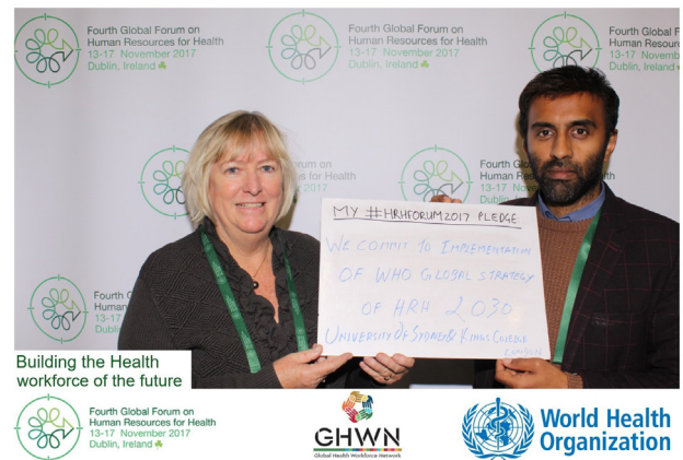
The authors at the Forum with their pledge.

Based on the WHO Global Strategy for HRH 2030, it was considered useful to develop an internationally recognised postgraduate professional programme on HRH policy and planning. This initiative will be the sole focus of the GHWN Leadership Hub. The WHO plans to collaborate with relevant academic institutions and partners with a view to have the course(s) administered by one or more higher education participating institutions on the basis of a syllabus approved by WHO.