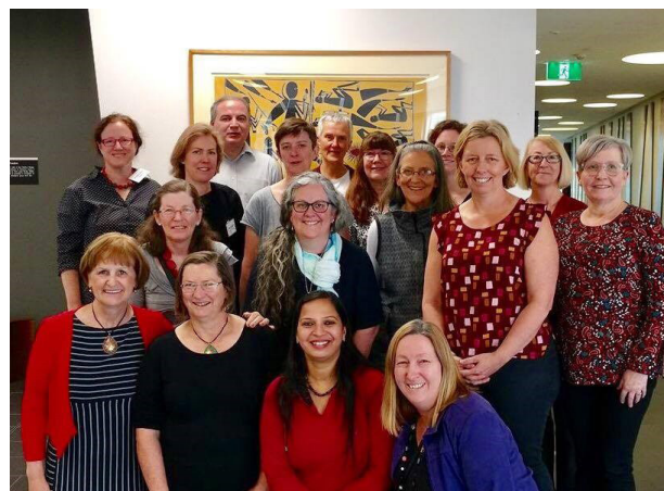
Pictured: Some of the WBTi team

The WBTi tool is made up of 15 indicators in total. Each indicator has a score of 10, meaning the country ends up with a score out of 150. You can have a closer look at each indicator in the Assessment Tool here .