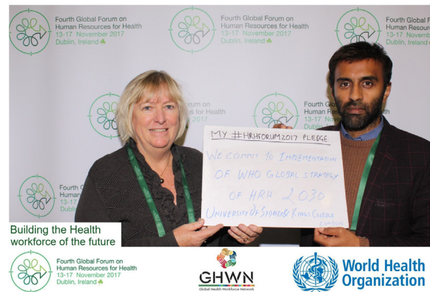
The authors at the Forum with their pledge.

Based on the WHO Global Strategy for HRH 2030, it was considered useful to develop an internationally recognised postgraduate professional programme on HRH policy and planning. This initiative will be the sole focus of the GHWN Leadership Hub. The WHO plans to collaborate with relevant academic institutions and partners with a view to have the course(s) administered by one or more higher education participating institutions on the basis of a syllabus approved by WHO.